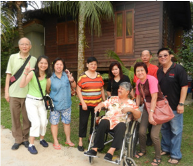
In Johor Baru, during CNY shopping on Jan 18

It is more than apt to call her An Able Auntie. Despite her mobility disadvantage, she is always cheerful, always giving thanks to the Lord and sharing her optimism in Hokkien with the words “ kam sia chu ” (Thank the Lord) and “ chu chiok hok moa moa ” (God bless you richly).