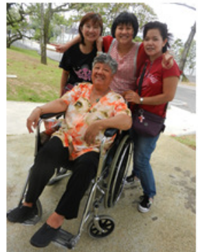
At Sembawang Park, during CNY shopping trip on Jan 22.

In fact, for every outing organized by the Dialect Ministry, she is invariably the first one to register her name. She is so eager to go on excursions that whenever she sees me, she would ask, “Pui kee ai pui ki toh loh?”